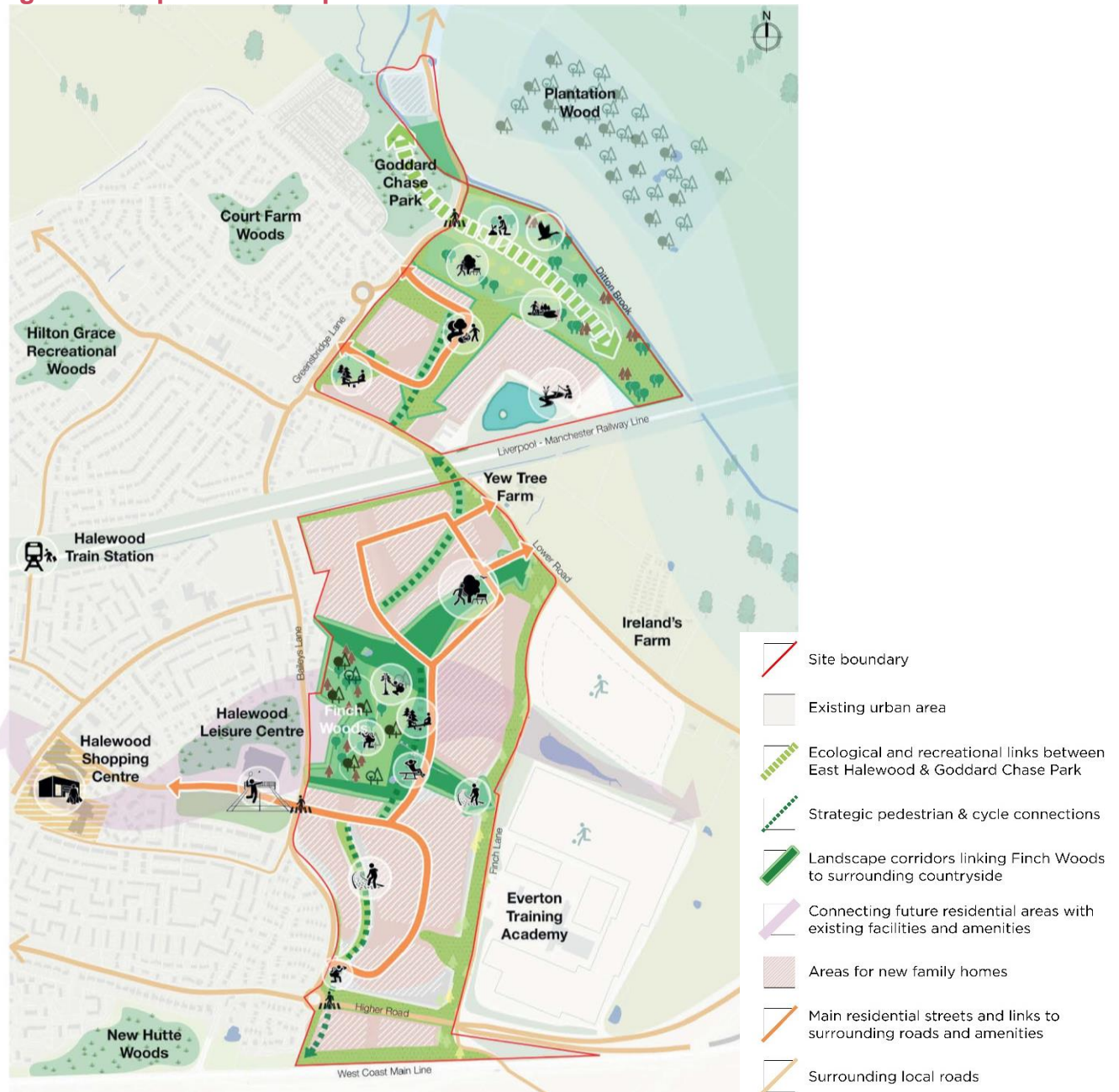
Figure 4.1: Spatial Development Framework

Not to scale