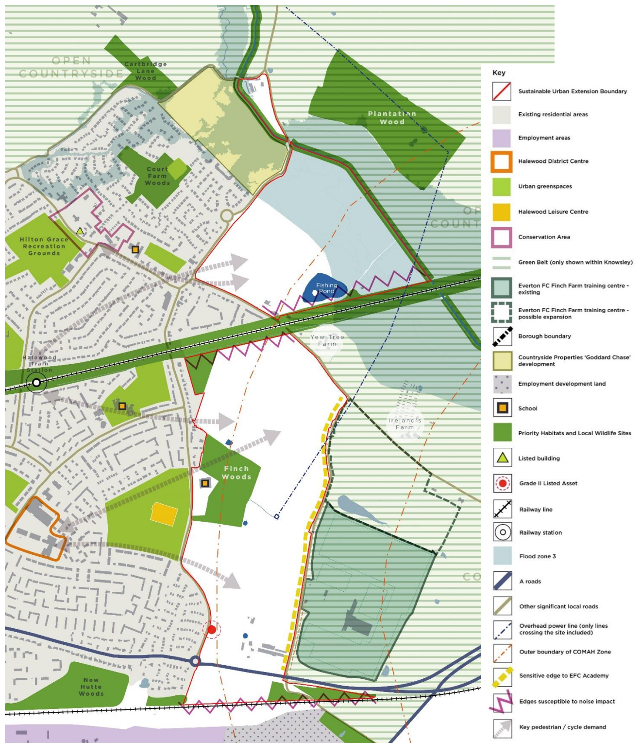
Figure 2.1: Opportunities and constraints map

Not to scale © Crown copyright 2020 Knowsley Council 100017655