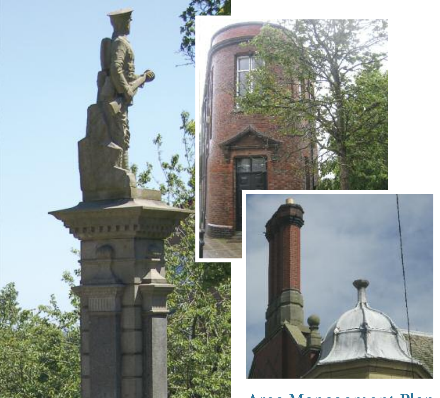
Area Management Plan May 2012