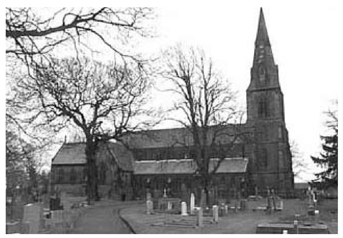
St Mary's Church, Present Day