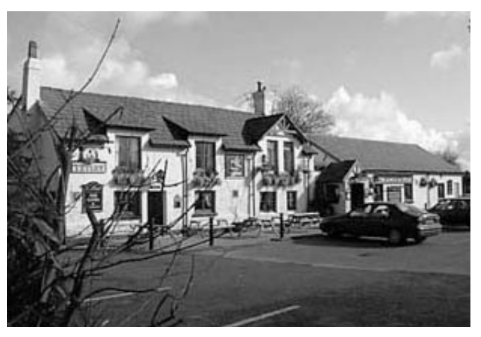
Date of Photograph: 1998. The name Eagle and Child derives from the crest of the Stanley's, Earls of Derby, and their ancestors the Lathom family.

The two cottages on Hollies Road are included in the Conservation Area and form part of the Eagle & Child grouping. Both cottages are rendered in a similar colour, however one of the cottages has had inappropriate windows fitted and modern extensions added.