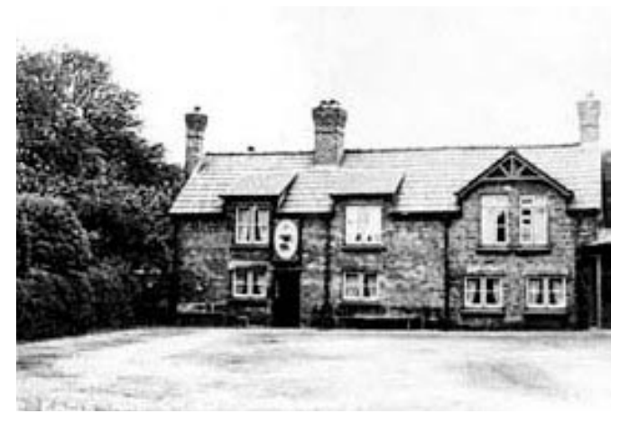
Date of Photograph: 1950's. The Eagle & Child Inn has existed on this site since the late 17th Century.

St. Nicholas Church is a Gothic style, Grade II Listed Building and displays pew boxes and stained glass designed by William Morris. The old rectory has an attractive late Georgian frontage and retains the original pattern of windows.