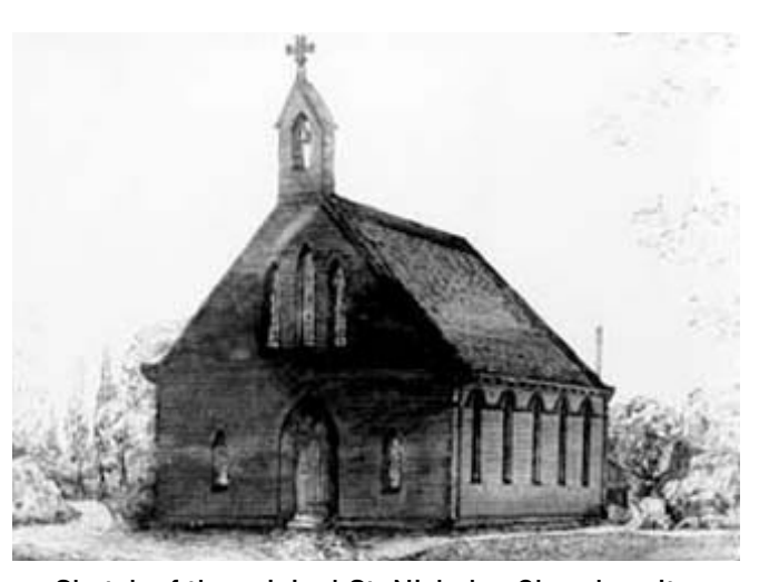
Sketch of the original St. Nicholas Church as it may have appeared in 1839, before the transept (1847) tower and bells (1882-83) were added.

The area known as Halewood Lane Ends evolved into Halewood Village and the church of St. Nicholas was built in 1839. The church was significantly altered in 1847 and the tower and bells were later additions in 1883. The village school was built next door to the church in 1876.