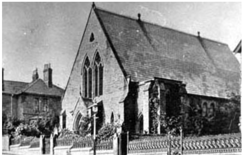
Date of Photograph 1930's. Congregational Church, Aspinall Street, Prescott. It was built in 1878 in a newly constructed street that joined Eccleston and Kemble streets.

The United Reform Church and Sunday school on Aspinall Street are important features to be included in this Conservation Area as they are an outstanding historical aspect surrounded by the close modern development.