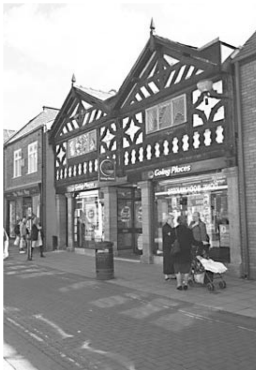
Date of Photographs: 1900's and 1998 Old half-timbered house in Eccleston Street, Prescot used as shop premises.

In the prosperous Georgian and early Victorian periods many buildings were rebuilt within medieval plot layouts and there are a number of fine Georgian houses surviving, particularly in Vicarage Place, Derby Street and the High Street.