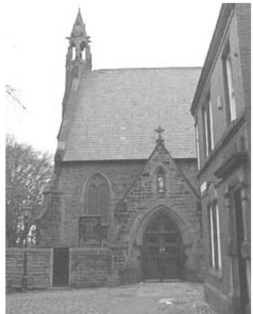
Date of Photograph: 1998. The Roman Catholic Church of 'Our Lady of the Immaculate Conception and St. Joseph', is located at the end of Vicarage Place, Prescot. It was built in 1856 by J. A. Hansom, the inventor of the Hansom 'cab.' Vicarage Place appears to have changed very little since the mid-nineteenth century and although restoration work has been carried out in this area, it has been completed sympathetically to its surroundings.