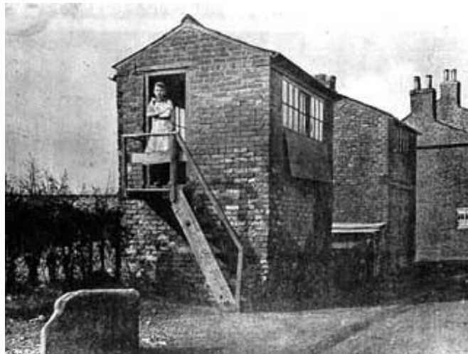
Date of Photograph: 1893.

The small watchmaker's shops were a common sight in the Prescot district. Watchmaker's premises could easily be identified by the long windows on either side of the building which supplied the maximum light possible for the watchmaker to work by.