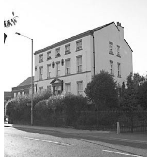
Date of Photograph: 1930's and Present Day.

Postcard view of High Street, Prescot. Many of the Georgian buildings along this street survive today.