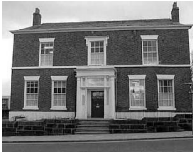
Date of Photograph: 1998.

Postcard view of High Street, Prescot. Many of the Georgian buildings along this street survive today.