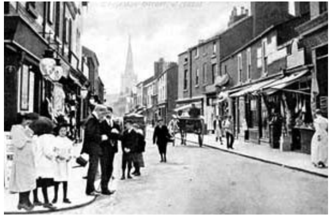
Date of Photograph: 1910. This busy street scene was taken looking west along Eccleston Street towards St. Mary's Church. Taken around 1910, when horse-drawn transport was still used for deliveries.