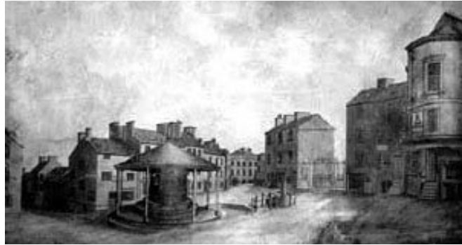
Date of Photograph: 1809. Prescot Market Place.

Prescot is believed to be Anglo-Saxon in origin, with the name 'Prescota-cot' meaning a 'priest cottage'. In 1333 the Lord of the Manor, William D'Acre, was granted the right to hold a weekly market and the town's importance is reflected in its inclusion on the Bodleian Map of Britain drawn by Gough in 1350.